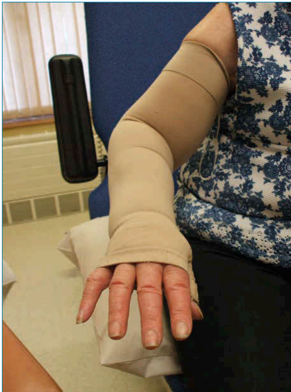
Figure 8. Patient fitted with a class 1 JOBST Bella Lite garment, which resulted in a decrease in swelling