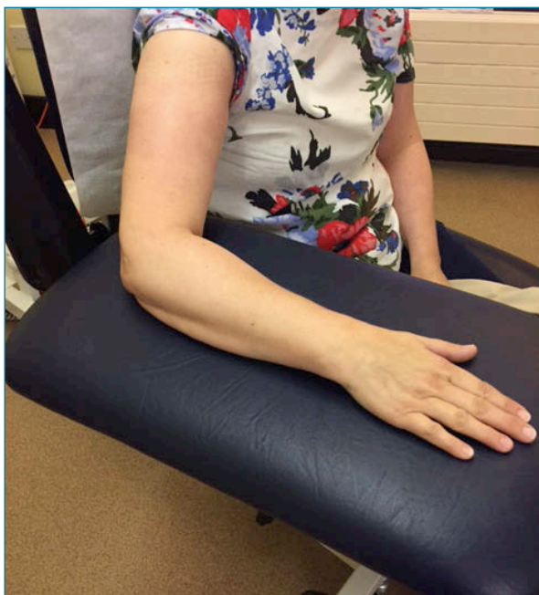
Figure 1. Mild lymphoedema to the dorsum of the hand