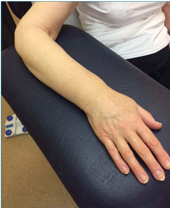
Figure 3. Right hand oedema with distal forearm swelling in November 2016