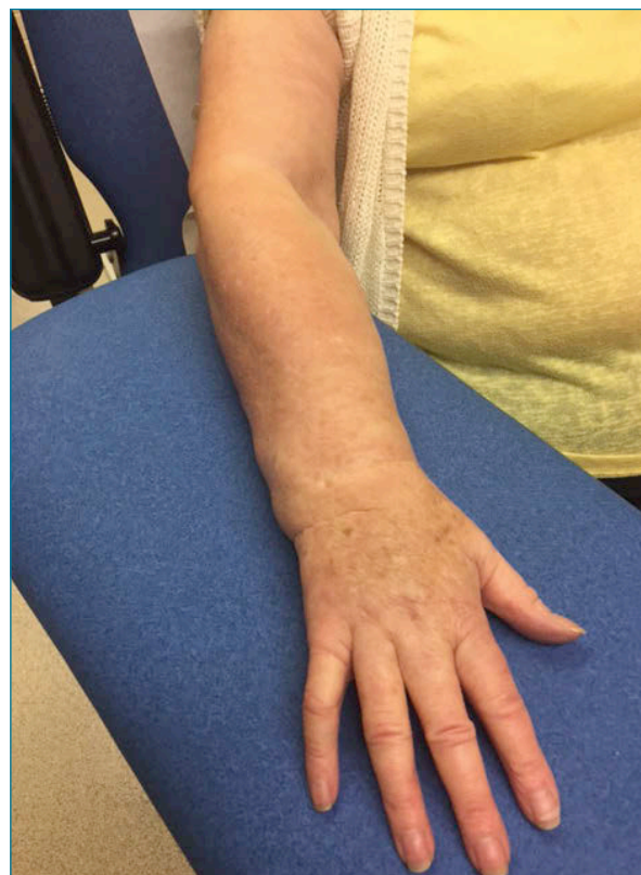
Figure 7. Patient assessment in August 2015 following mild lymphoedema after a mastectomy