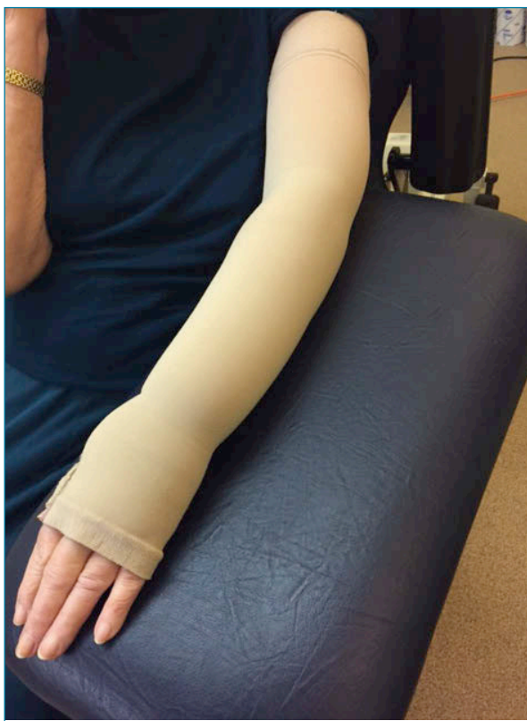
Figure 6. Patient fitted with a class 2 JOBST Bella Lite combined armsleeve, size large regular with grip top

Initially, there was a reduction in the distal excess volume to 21% after 6 weeks; however, this increased to 26% after a further 2-month follow-up, but this was thought to be due to having a knee replacement and utilising walking sticks following this, which likely put additional strain on the arm and increased the swelling. She found the sleeve very comfortable and controlled the oedema but she did not feel it necessary to wear the glove.