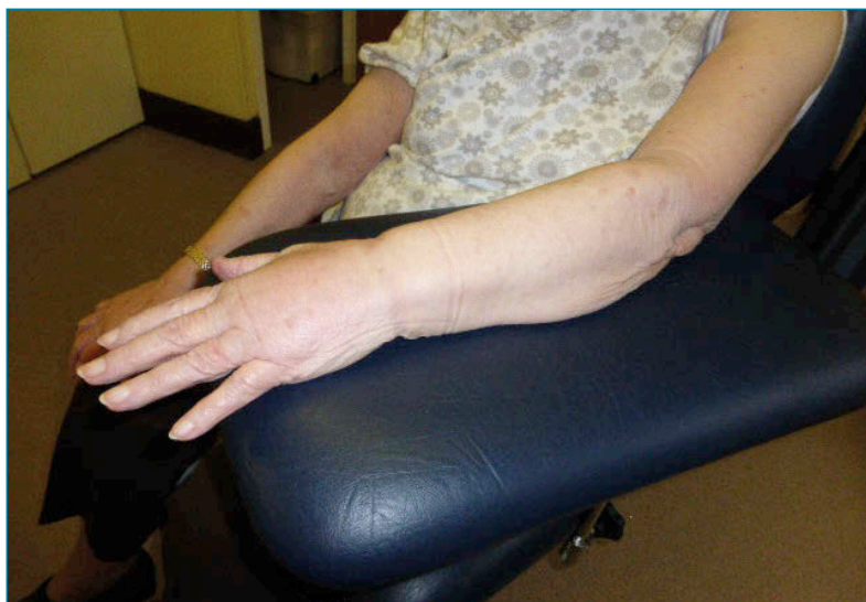
Figure 5. Patient assessment of left arm swelling in October 2016

Follow-up was carried out 5 weeks later in January 2017, where her total excess volume was measuring 3% and her distal excess had reduced to 17% (143ml), having reduced by 87ml. In February 2017, her overall excess volume measured 4%, with the distal volume measuring 12% (99ml), having reduced a further 50ml. In April 2017, her overall excess was 2% and the distal excess was reduced