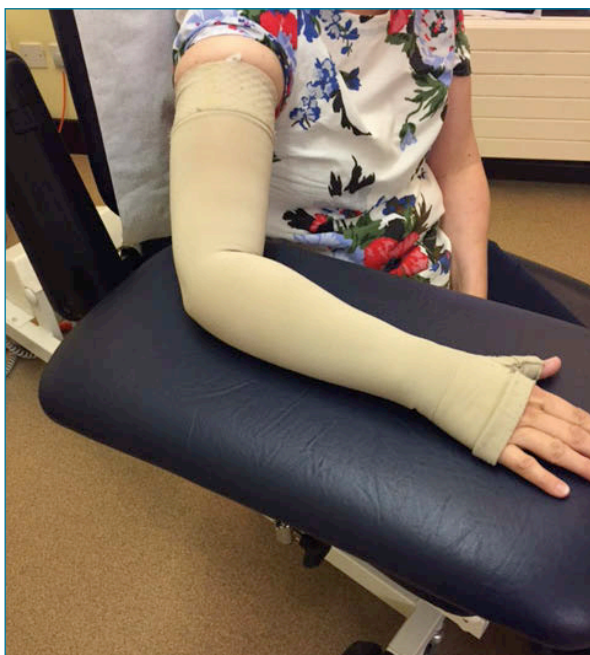
Figure 2. Patient fitted with a class 2 JOBST Bella Lite combined armsleeve, in size small regular with a grip top

purposes. Monitor the skin for signs of infection, such as heat, discolouration and pain, and take appropriate action immediately by initiating antibiotics as per British Lymphology Society guidelines ( www.thebls.com ).